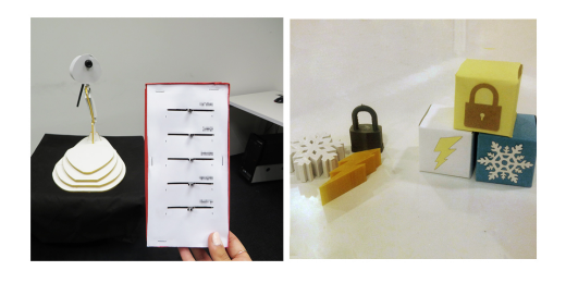
Fig. 4. Design studies using puppet prototypes with a "Personality Meter" (left), and two forms of TUI objects: "phicons" and cubes (right).

1) Morphology / Size: When analyzing the quantitative data, we found the largest robot was rated highest on all five personality measures, with a trend showing that the smaller the robot was, the lower it was rated (Fig. 5). The qualitative findings also supported this conclusion. In the