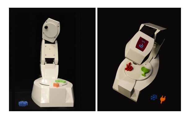
Fig. 1. Vyo, a personal robot serving as a centralized interface to smart home devices. The microscope-like robot transitions between being a social agent communicating with the user (left) and an inspection device used as a tool (right). 3D-printed icons represent smart home devices and are placed on the robot's turntable to activate devices and to control their settings.

The final prototype is a large microscope-like desktop robot (Fig. 1) capable of social gestures. Users communicate with it using tangible objects ("phicons") placed on a turntable at the robot's base. Each phicon represents one smart home device, and is used to turn the device on and off,