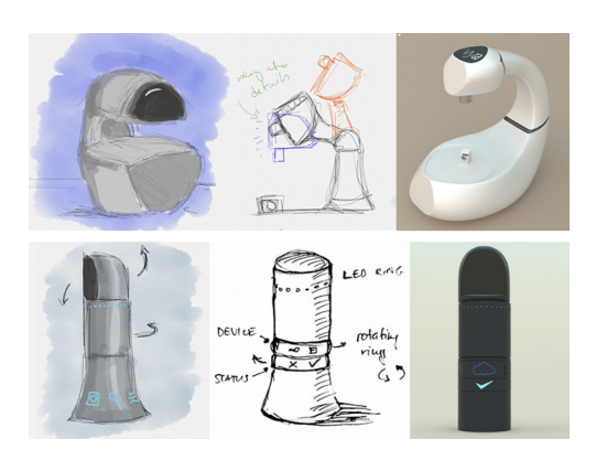
Fig. 2. Morphology sketches and high-fidelity 3D models of two concepts: Expressive Appliance (top) and Consumer Electronics (bottom).

Previous research, expert input from industry, and our own user interviews all suggested that domestic technology should be at least semi-automated, aspiring to as few disruptions as possible. This would allow people to focus on developing close relationships within their family [29], [4]. Thus, our second design goal is to design a robot that will