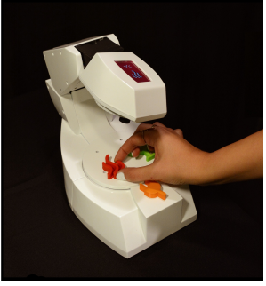
Fig. 6. The resulting prototype, including a rotating monocular facial expression system (left) and "phicons" to control and monitor smart home devices (right).

panic", was designed to move the robot from the periphery of the user's attention to the foreground.